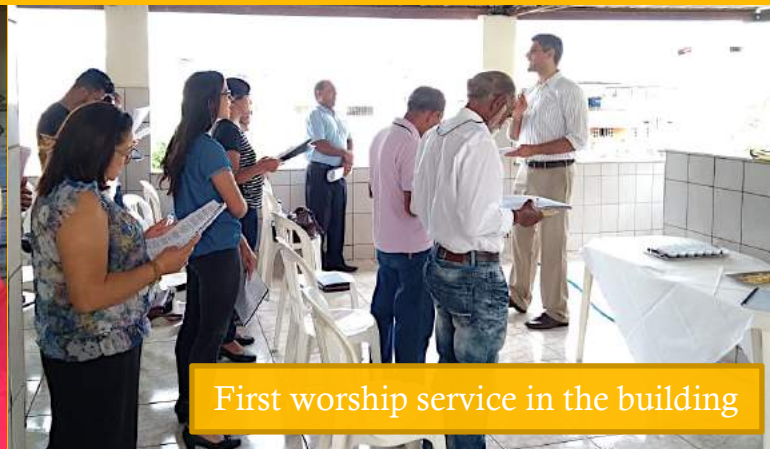
First worship service in the building

God is using His Church in Belo to be multiplier of His Kingdom in other cities! On the 16 th of December, the Church of Christ in Ipatinga, an area of 500.000 people, officially held the first worship service in the well located rented building! We had 28 people in attendance that Sunday morning and one third of them were visitors! As we campaigned during that weekend, we held a gospel meeting based on John 14:6 and I spoke on Jesus being the only Truth! Please pray for this mission as the Lord's church is being established in Ipatinga!