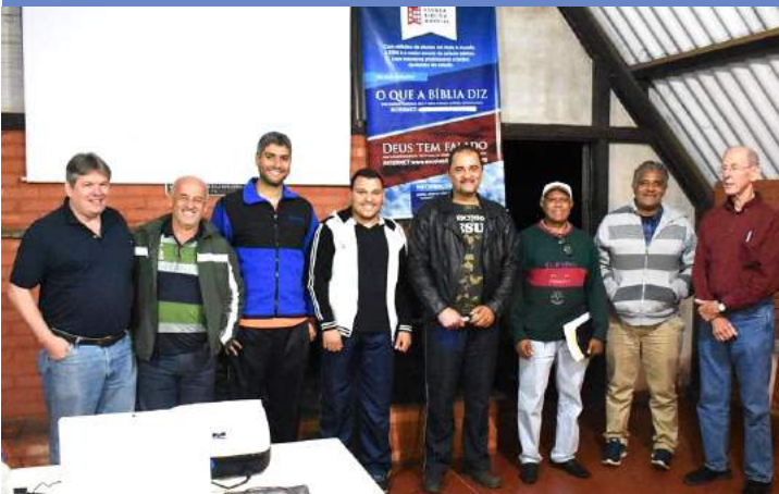
Men from 8 different congregations organized the event