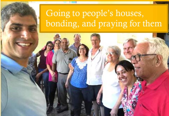
Going to people's houses, bonding, and praying for them